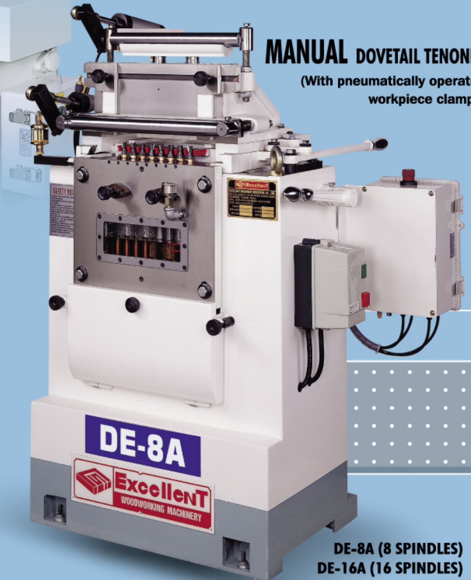
DE-8A (8 SPINDLES) DE-16A (16 SPINDLES)