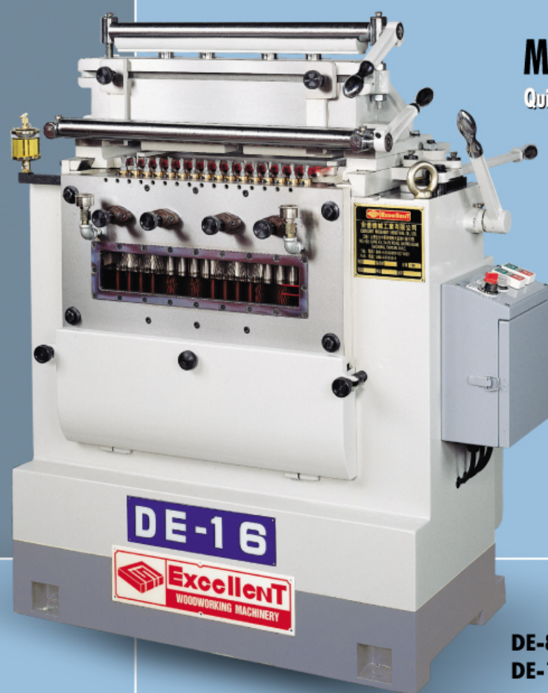
DE-8 (8 SPINDLES) DE-16 (16 SPINDLES)

Quickly process male and female tenons simultaneously!