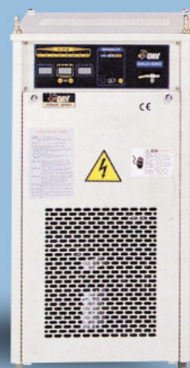
OIL COOLER (OPTIONAL)

Designed for parts machining for high grade furniture, construction materials, boats and musical instruments, etc.